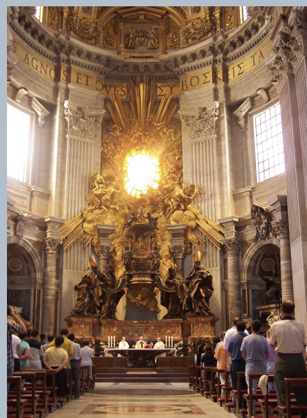
A false belief has been long entrenched in Christianity

Here is where the similarities stop. Daniel is given greater details of this final beast – the one that not only is terrible, but also has 10 horns (like the image of Dan. 2 had ten toes) and out of which grew a “little horn” that “spoke great things” against the Most High (Dan. 7:8). So, what is this little horn power? Here are nine characteristics from the Bible: