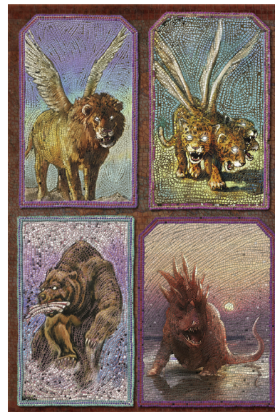
Daniel 7's beasts represent four kingdoms